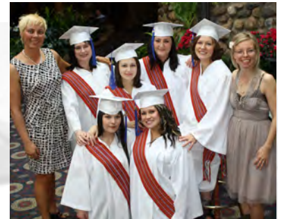
Saskatoon LPN Graduating Class 2011

Since 2000, DTI has graduated almost 200 Practical Nurses, LPN's are in demand in the provincial health system and DTI works closely with the various health regions to ensure our students are connected to employers.